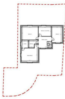
Proposed first floor plan