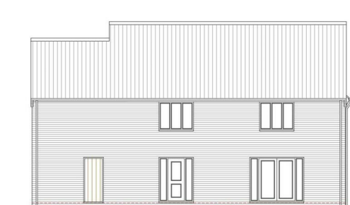
Rear elevation - Western