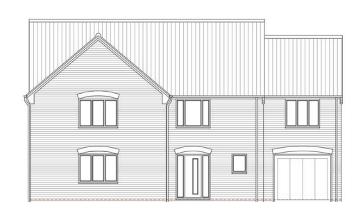
Front elevation - Eastern