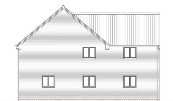
Side elevation - Southern